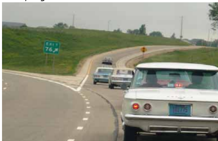
The group managed to stay together... even on the highway.