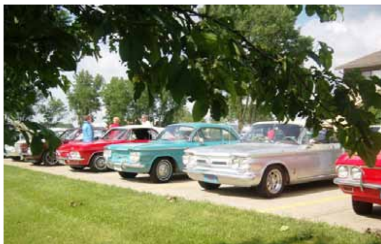
A bright and sunny morning -- a great way to finish the Spring Tour.