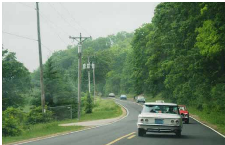
On the road just outside of Madison heading toward Mt. Horeb, WI.