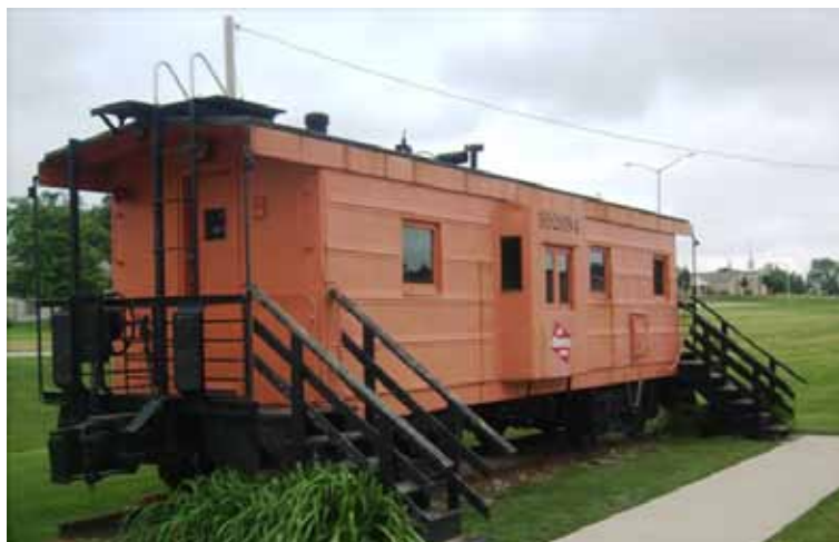
Old train car from the Milwaukee railway in Monroe, WI. On display at the Cheese Museum.