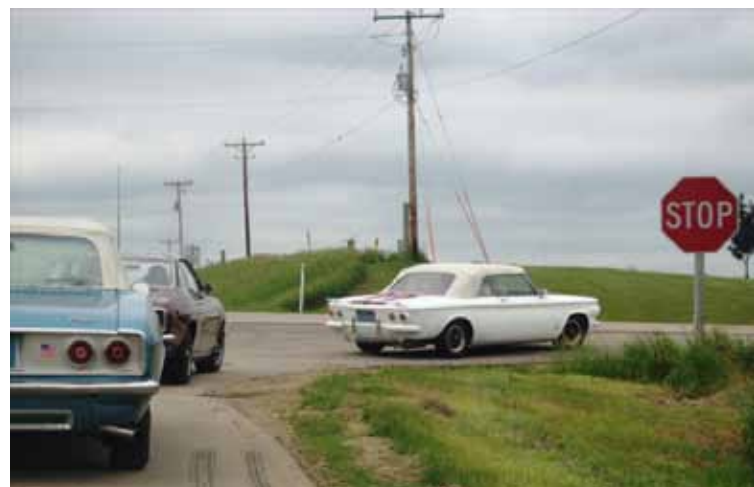
Winding our way through the green, rolling hills of southwest Wisconsin.