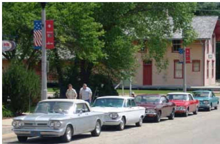
Taking a break in downtown New Glarus, WI.